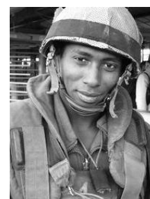
Ethiopian Israeli soldier in Nablus, in 2006

CHOMSKY: Israel didn’t want the Falasha in the worst way, and for a long time they just refused to allow them in. But there were some Jewish groups in the United States that were both Zionist and civil libertarian, and they started a big campaign, with a lot of publicity on the issue. And Israel really began to look bad. When people didn’t know about it, people didn’t care, but when it got to be