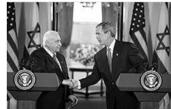
President Bush and Prime Minister Sharon, White House, 2004

Page 114 under section titled "American Educational trust – Publishers Page"