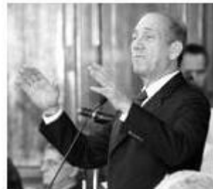
Ehud Olmert אהוד אולמרט

1780 Ehud Olmert (Hebrew: אהוד אולמרט, IPA: [e'hud 'olmɛrt] (listen), born 30 September 1945) is an Israeli political figure, and former Prime Minister of Israel having served from 2006 to 2009. Olmert was the mayor of Jerusalem from 1993 to 2003. In 2003 he was elected to the Knesset and became a minister and Acting Prime Minister in the government of Prime Minister Ariel Sharon. On 4 January 2006, after Sharon suffered a severe haemorrhagic stroke, Olmert began exercising the powers of the office of Prime Minister. Olmert led Kadima to a victory in the March 2006 elections (just two months after Sharon had suffered his stroke) and continued on as Acting Prime Minister. On 14 April, two weeks after the election, Sharon was declared permanently incapacitated, allowing Olmert to legally become Interim Prime Minister. Less than a month later, on 4 May, Olmert and his new, post-election government were approved by the Knesset, thus Olmert officially became Prime Minister of Israel.