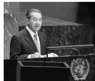
Mahathir bin Mohammad in UN.

7705 "We [Muslims] are actually very strong, 1.3 billion people cannot be simply wiped out. The Nazis killed 6 million Jews out of 12 million [during the Holocaust]. But today the Jews rule the world by proxy. They get others to fight and die for them. They invented socialism, communism, human rights and democracy so that persecuting them would appear to be wrong so they may enjoy equal rights with others. With these they have now gained control of the most powerful countries. And they, this tiny community, have become a world power."